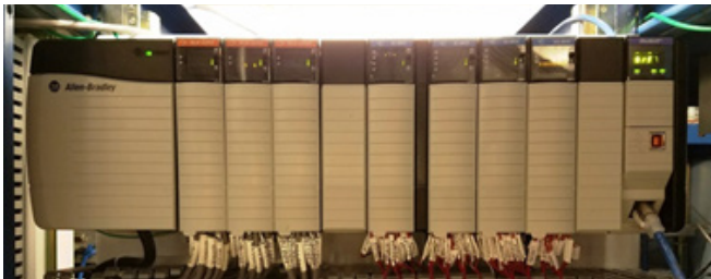
FIG. 3. PLC system remote chassis.

The remote A10 chassis houses three relay modules, three digital input modules, a sequence of events (SOE) module, and an Ethernet module, Fig 3.