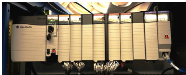
FIG. 2. PLC system local chassis.

The analog input modules read sensor signals from pressure, heaters, helium liquid level (based on differential of pressure) and its probes, lead and magnet reservoir sensors of the SST, flows in the current leads, electric valve positions, and vacuum monitoring.